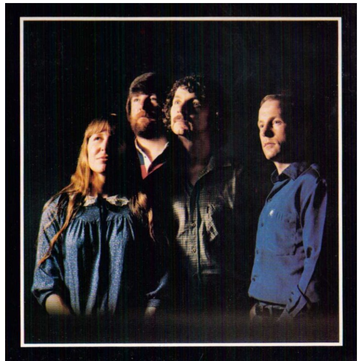
'Heritage' – the club's first ever guests