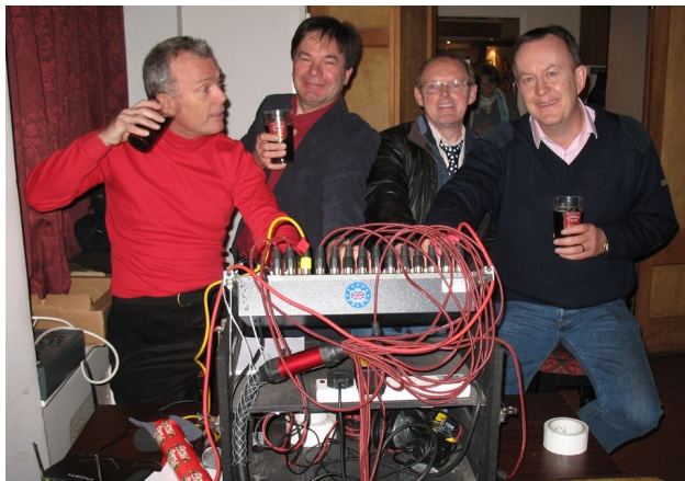
The Ram Sound Crew. "WHAAATT?"