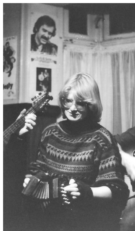
Recreating the atmosphere of the White Heather Club