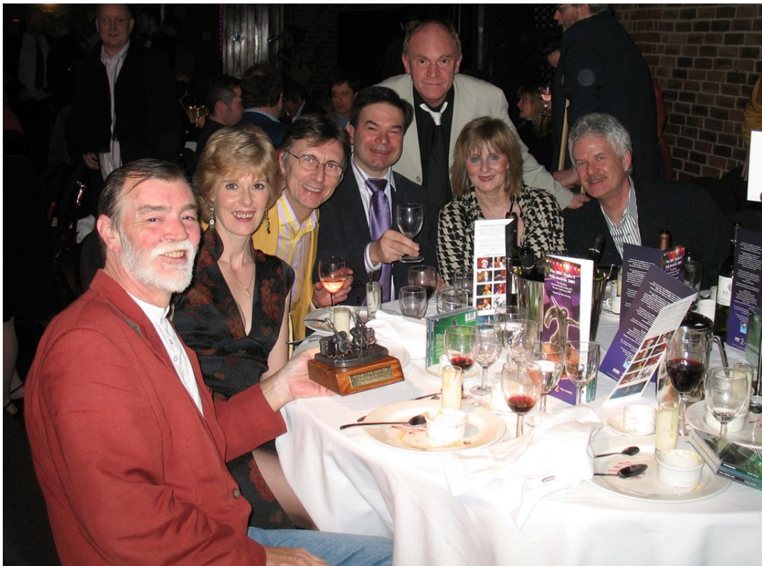
Mixing it with the great and the good when we picked up our Club of the Year award