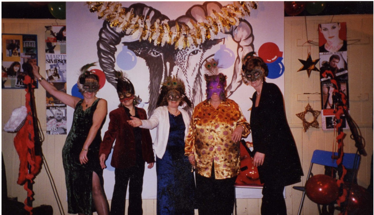
The Claygate Ladies Swingers Society with their famous 'Full Margo' routine