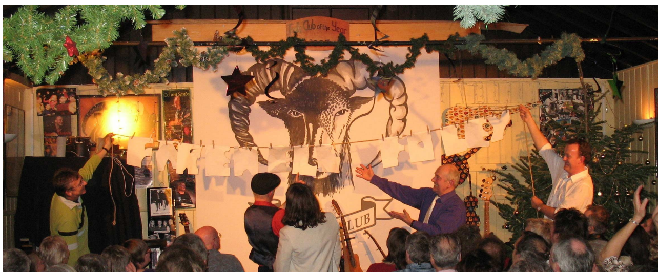
Last night at the Foley Arms with Omega 3